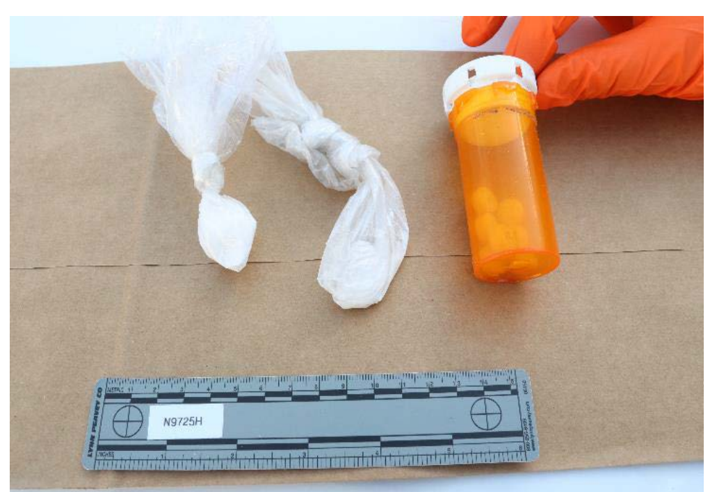
Narcotics in Decedent's possession: one clear baggie containing 3.2 grams of methamphetamine, one clear baggie containing 1.8 grams of methamphetamine and one pill container containing 7 hydrocodone tablets.