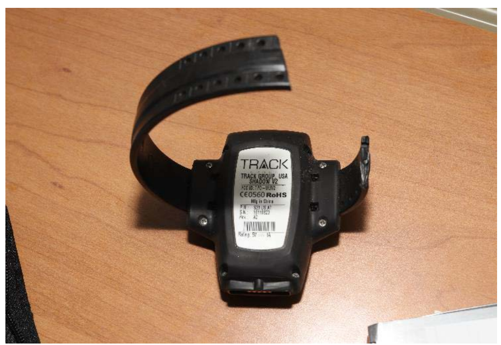
Decedent's recovered house arrest ankle monitor.