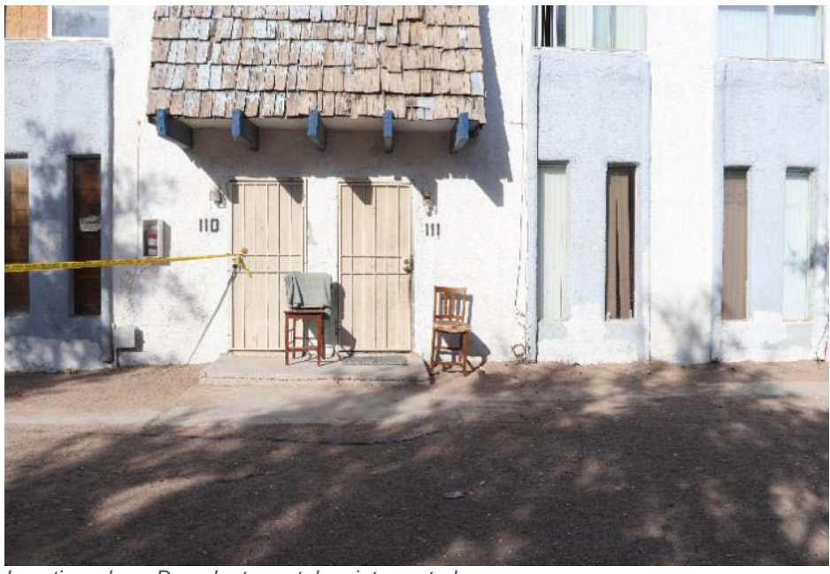
Location where Decedent was taken into custody.